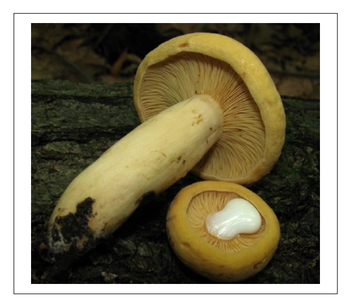
Figure 1. Lactarius volemus (popularly known as Tirmit in Central Anatolia).